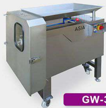
GW-350 Meat Dicer