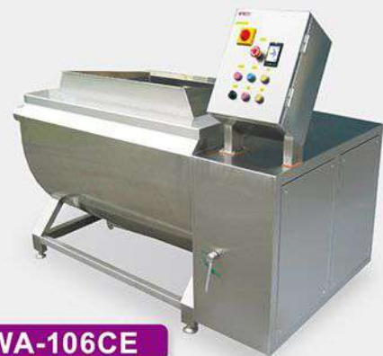
WA-106CE Multiple Vegetable Washer