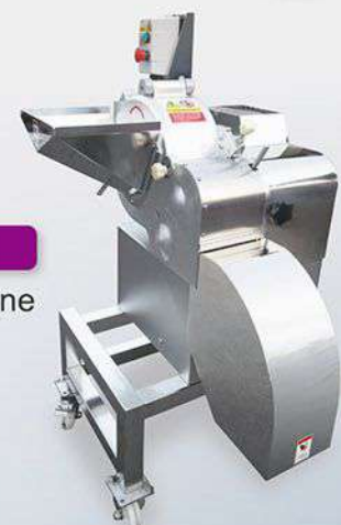
CD-800 Dicing Machine