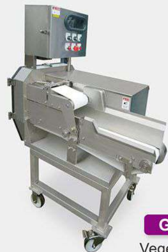
GW-805N Vegetable Cutter