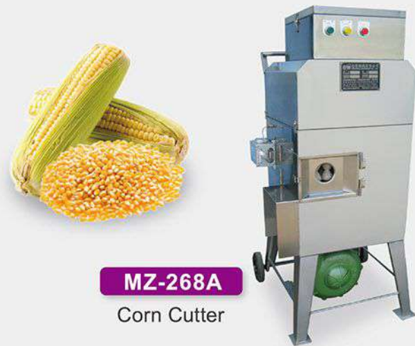
MZ-268A Corn Cutter