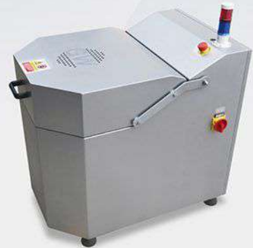
HY-06 Small Vegetable Centrifuge