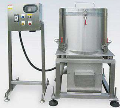
HY-15 Vegetable Centrifuge